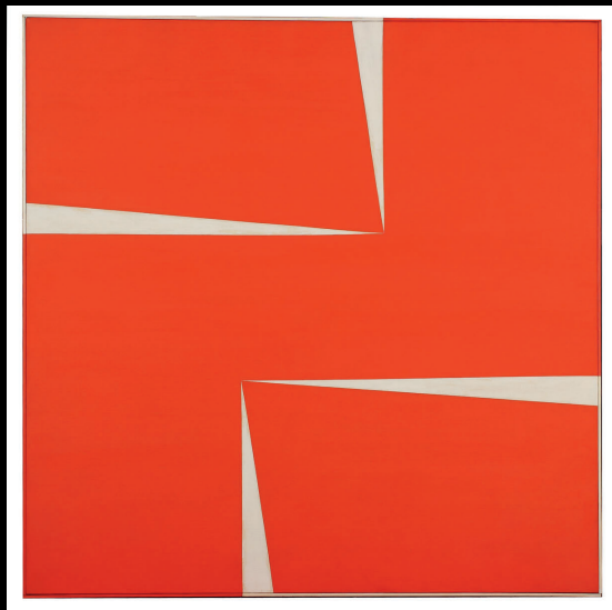
Carmen Herrera, Cadmium #4 , 1965, acrylic on canvas, 48 x 48 inches, Collection of The Newark Museum of Art, Gift of Mr. and Mrs. Henry Feiwel, 1970, 70.87. Image courtesy The Newark Museum of Art, © Estate of Carmen Herrera

? How are black and white used with the other colors?