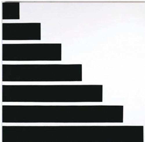
Carmen Herrera, Further , 1989, acrylic on canvas, 42 x 42 inches, Estate of Carmen Herrera.

Carmen Herrera used mathematical calculations as well as rulers, graph paper, and triangles to transfer her drawings to canvas.