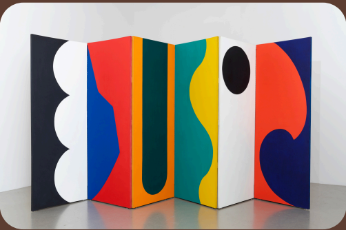
Leon Polk Smith, Six Involvements in One , 1966 (recto of "Seven Involvements in One", 1966), acrylic on canvas mounted on wood panel, Private collection. Image courtesy Lisson Gallery, © Leon Polk Smith Foundation